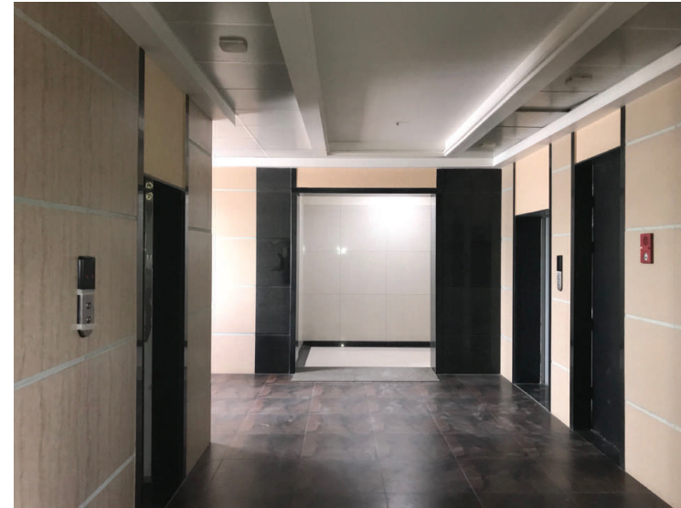
'Kumar Primus' Entrance Lobby