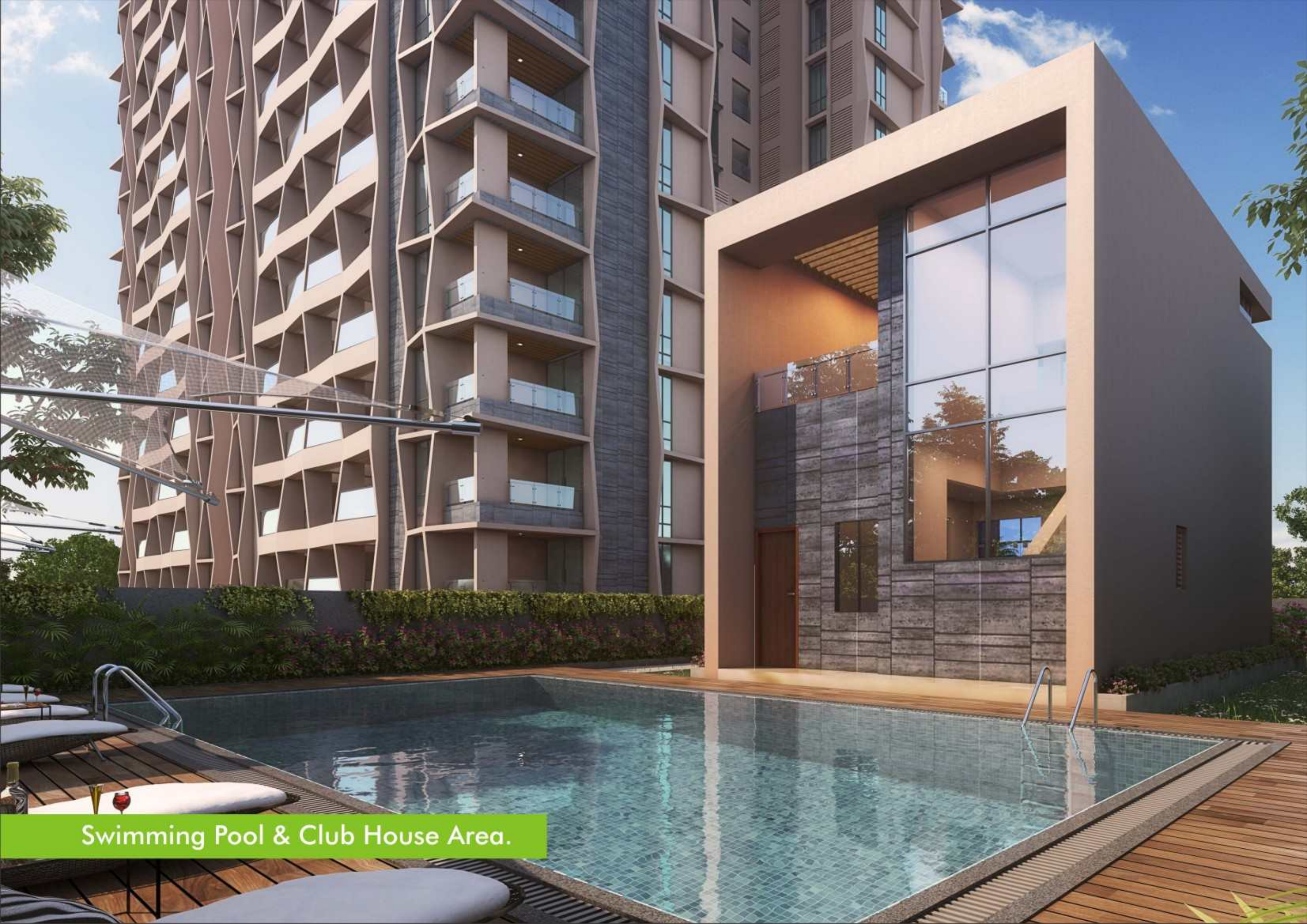
Swimming Pool & Club House Area.