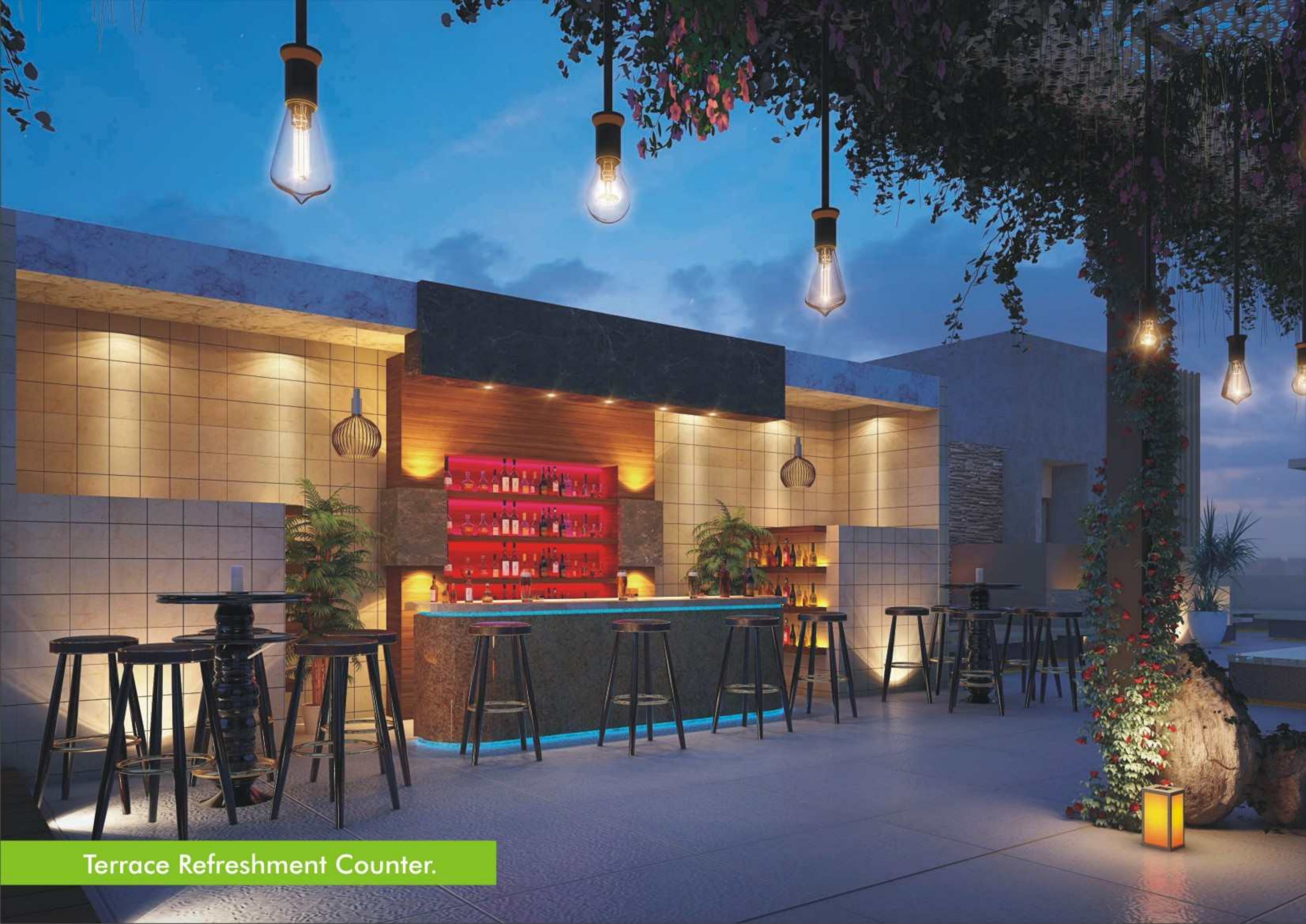
Terrace Refreshment Counter.