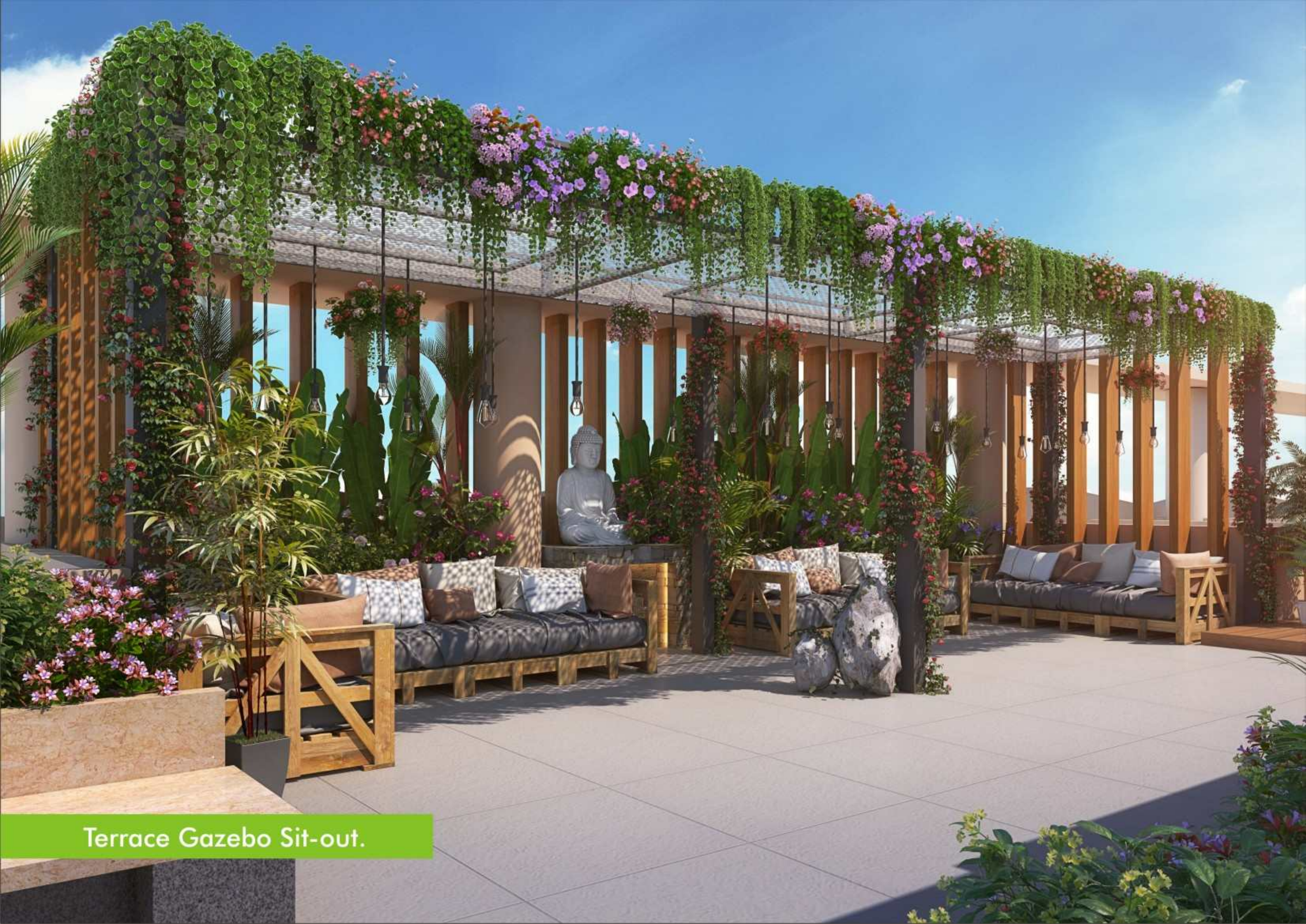
Terrace Gazebo Sit-out.