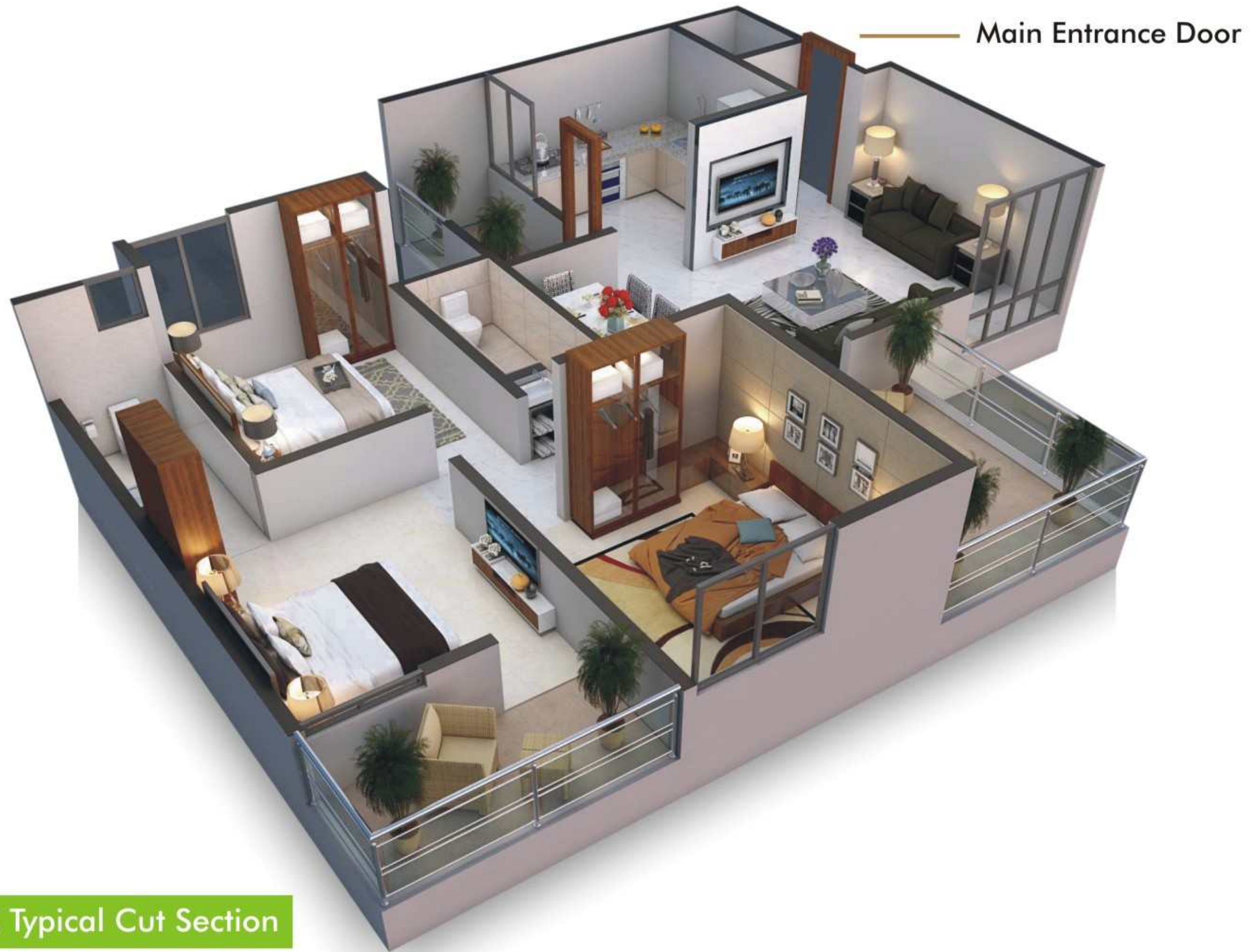
2.5 BHK Typical Cut Section