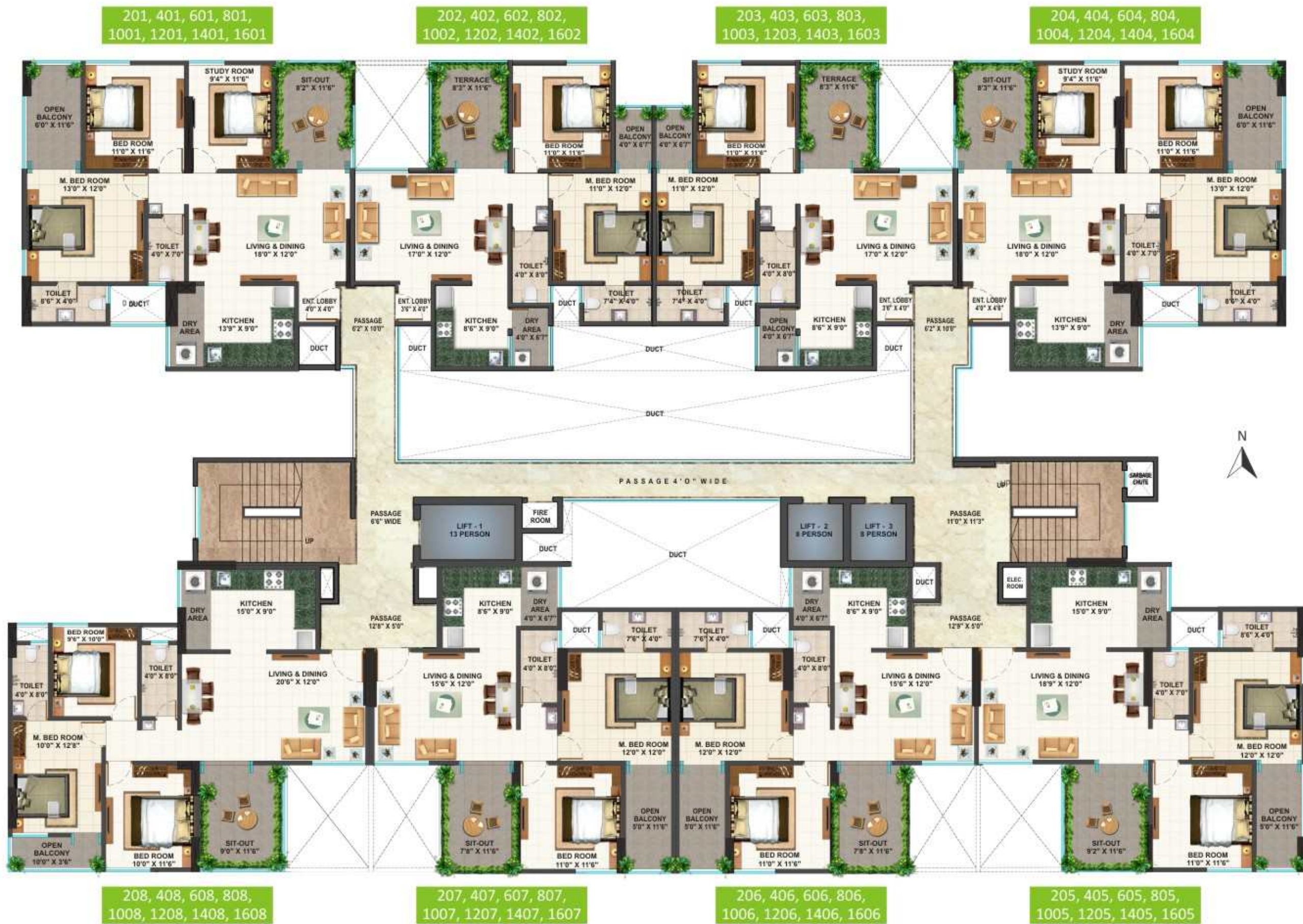
Typical Even Floor Plan