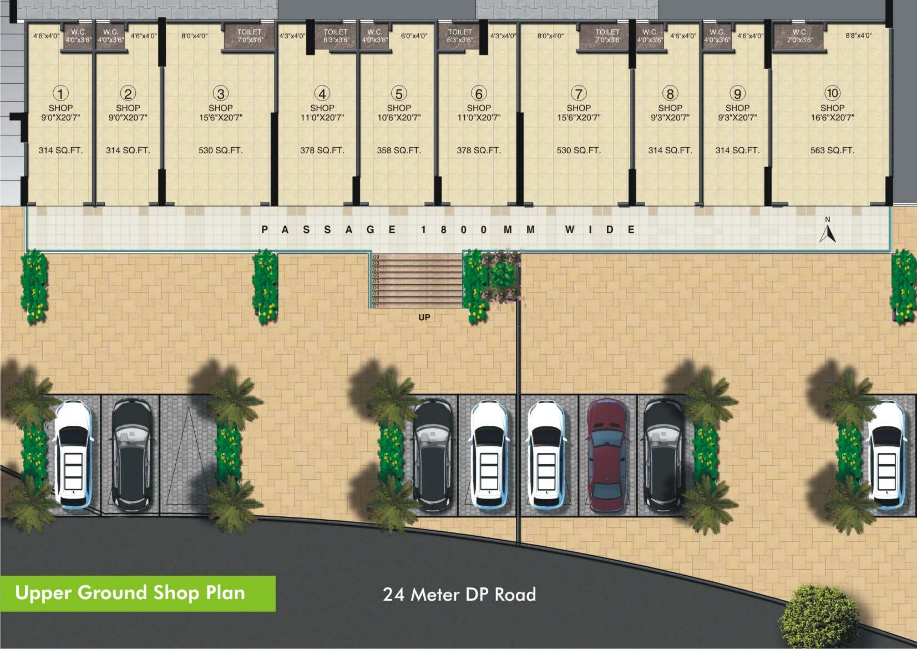
Upper Ground Shop Plan