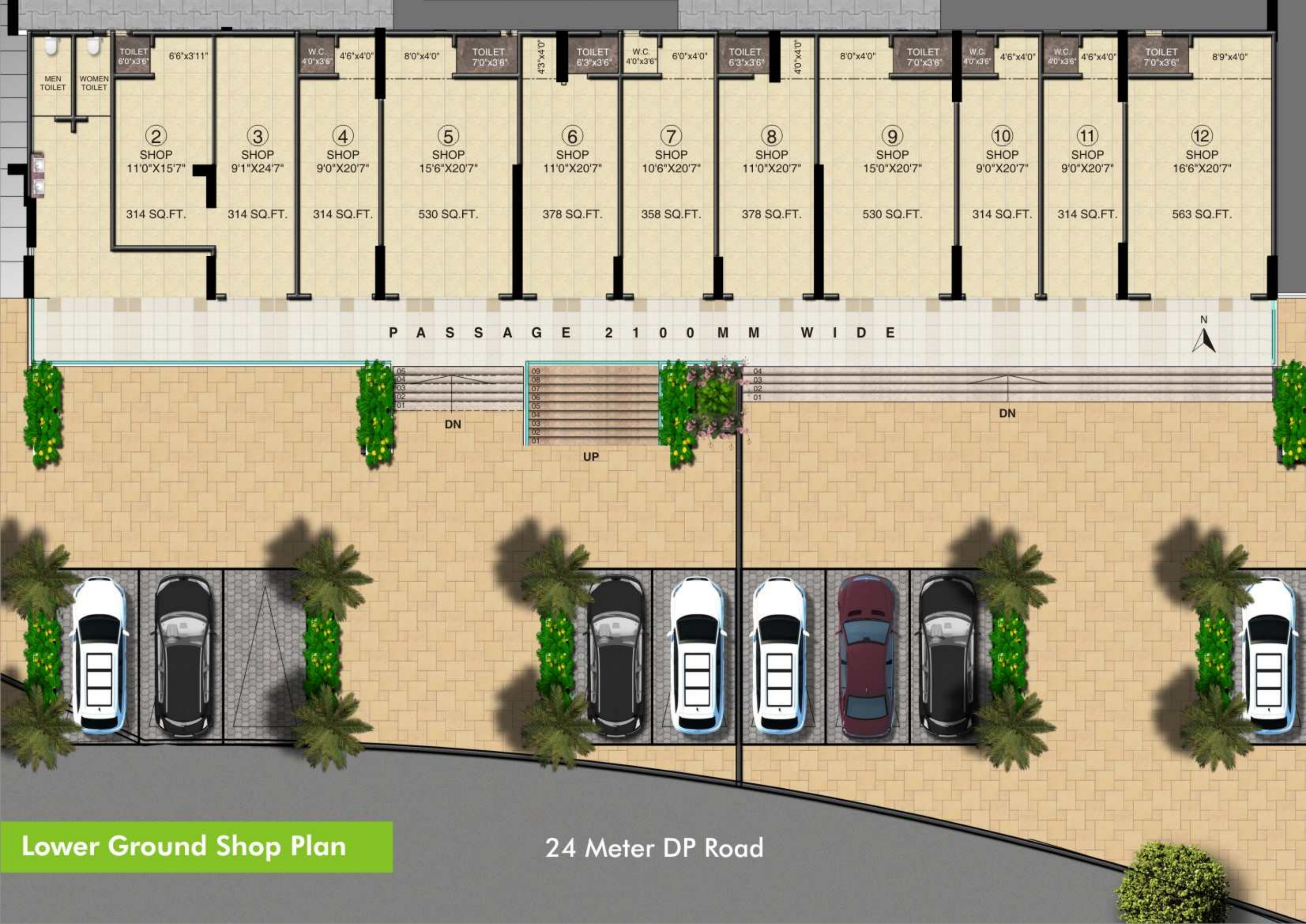
Lower Ground Shop Plan